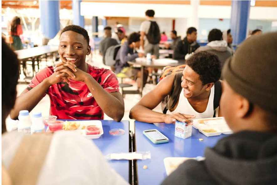
Provide afterschool & summer meals