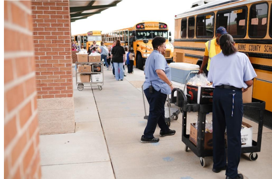
Prepare student meals for field trips